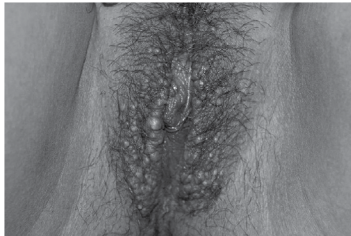
Figure 2. Syringoma hyperpigmented nodular lesions

Patient is followed up for a period of 2 years; during this time, the vulvar area remains free of lesions